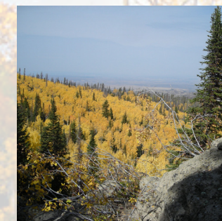
Top of Black Mountain