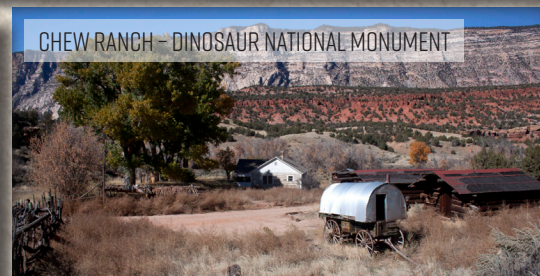
CHEW RANCH - DINOSAUR NATIONAL MONUMENT