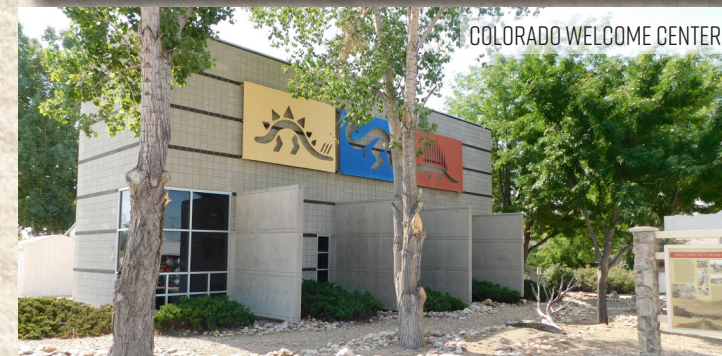
COLORADO WELCOME CENTER