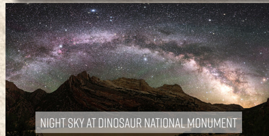
NIGHT SKY AT DINOSAUR NATIONAL MONUMENT