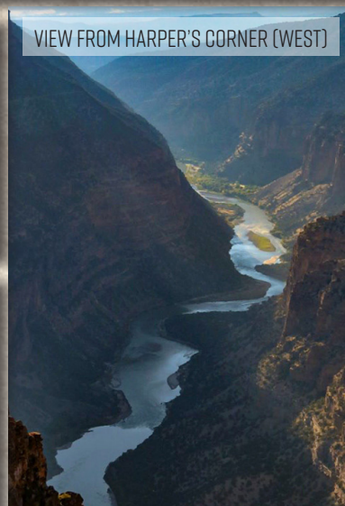
VIEW FROM HARPER'S CORNER (WEST)