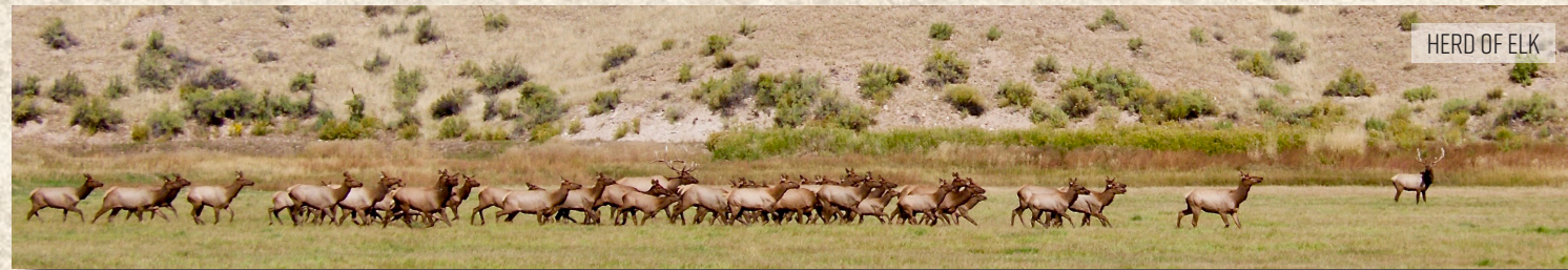
HERD OF ELK

The town of Dinosaur provides easy access to a variety of activities where visitors can experience nature at its best. Herds of elk, deer and pronghorn are prevalent on the area as well as other abundant wildlife of the high desert plateau. Enjoy hiking, hunting, rafting, biking and 4-wheeling. There are amazing opportunities for photography in every direction. Novice and professional photographers come from all over the world to take advantage of the incredible sunsets, sunrises, vistas, wildlife and more.