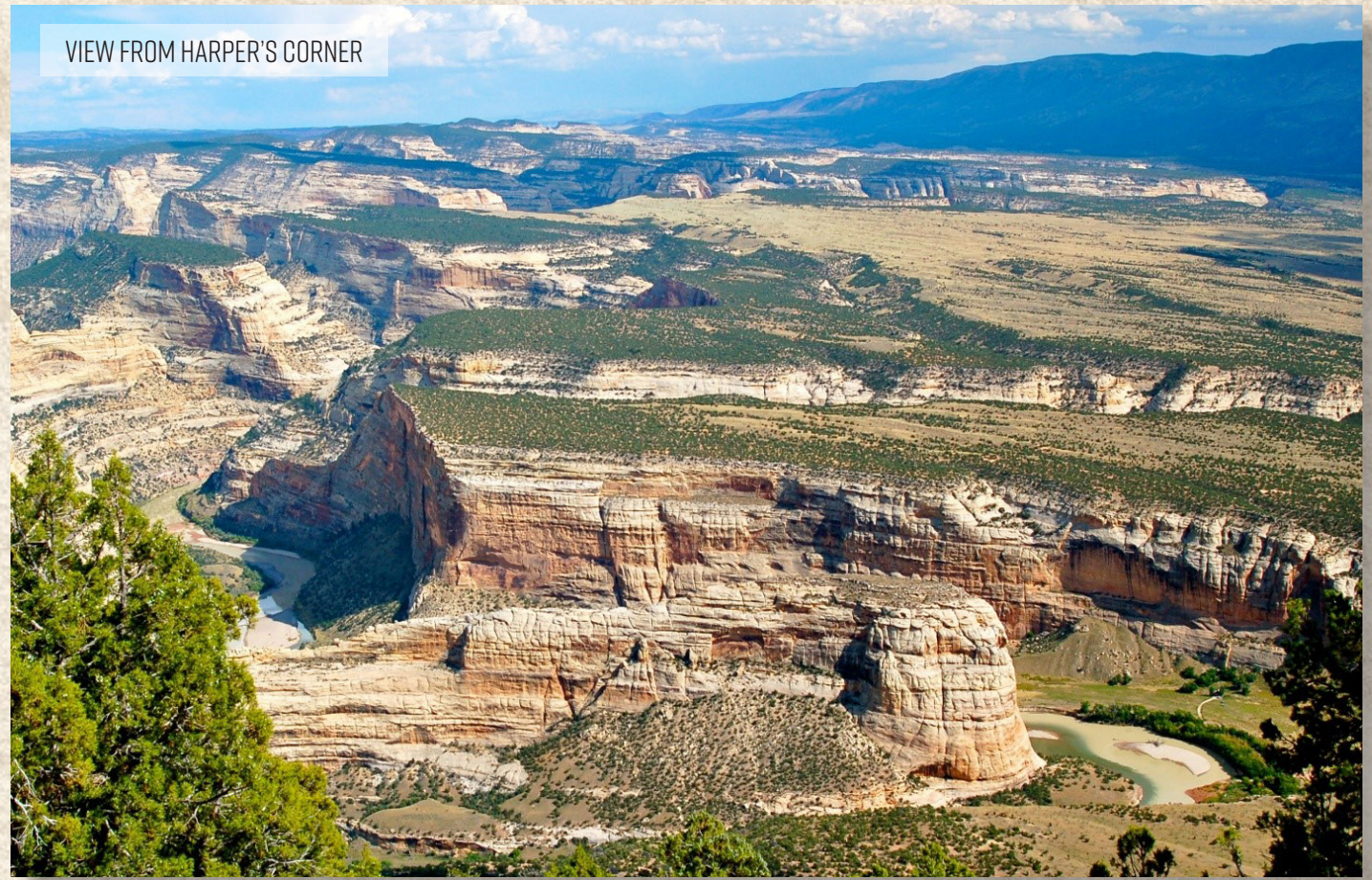
VIEW FROM HARPER'S CORNER

The 31-mile drive north of the town of Dinosaur to Harper's Corner offers many stops and hiking trails along the way to view incredible vistas in this amazing canyon country. The Cold Desert Trail (1/2 mile) and the Plug Hat Trail (1/4 mile) are both quick and easy hikes offering amazing views and scenic picnic areas; enjoy time in these breathtaking surroundings. The Ruple Point Trail is a 4 3/4 mile trail that also offers beautiful views and abundant opportunities for wildlife viewing and photography. When you arrive at Harper's Corner you will find a one-mile nature walk featuring incredible views of the confluence of the Yampa and Green Rivers over 2,000 feet below. Also below this overlook is the historic Chew Ranch and Echo Park where you can discover the wonders of the 'whispering cave,' ancient rock art and one billion years of geologic wonders.