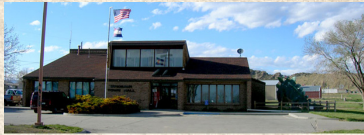
DINOSAUR TOWN HALL